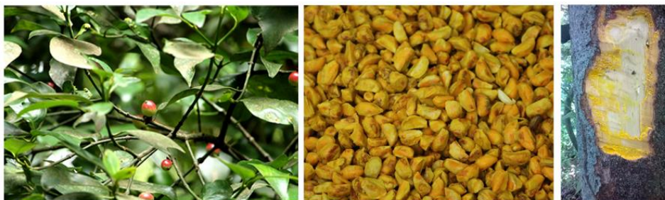
Figure 1. Garcinia morella twig, seeds and bark

True gamboge of use in arts and medicine in India derives mainly from the gum resin of G. morella ( Figure 1 ). The tree is distributed in Indo-Malay and Sri Lanka. All parts of the plant yield a thick yellow exudate.