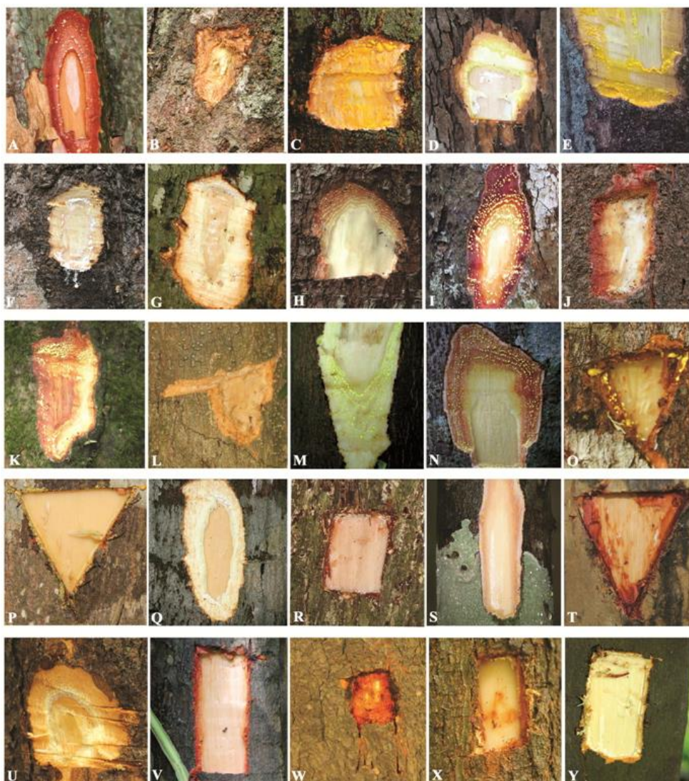
Figure 2. Garcinia bark exudates (A. G. rubro-echinata , B. G. imberti , C. G. wightii , D. G. travancorica , E. G. morella , F. G. talbotii , G. G. pushpangadaniana , H. G. indica , I. G. gummi-gutta var. gummi-gutta , J. G. gummi-gutta var. papilla , K. G. gummi-gutta var. conicarpa , L. G. andamanica , M. G. assamica , N. G. anomala , O. G. cowa , P. G. dhanikariensis , Q. G. dulcis , R. G. hombroniana , S. G. kydia , T. G. speciosa , U. G. xanthochymus , V. G. cornea , W. G. livingstonei , X. G. mangostana , Y. G. spicata )